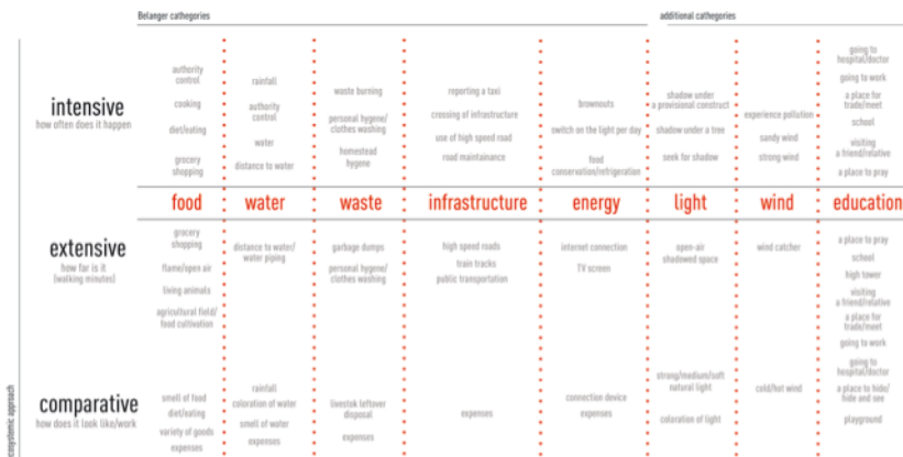
Figure 1. Ecological variables in Cairo's informal settlements (Antonia Chiesa)

(Gilbert A., 2007). Informal and spontaneous are rather the processes shaping the territory according to a performative use of space: the whole city is an exchange network system, where “fluxes of infrastructures, information technologies, energetic supply chains –such as water, power and fuel-, people and goods” (Corner J., 2006) are traceable. No longer understood as a tabula rasa upon which built forms are displaced, the broader urban context is a multi-dimensional system engaging integrated and hybridized cultural-natural ecologies (Nyamwanza A.M., 2012; Lister NM., 2010). Such state of continuous, various and even subversive transformation –so evident in the informal city- shows some reluctance to be approached traditionally. Given its complex relational nature, multiplicity and multi-layer state of continuous transformation, informal processes of urbanization resemble, and may be interpreted as, ecological processes.